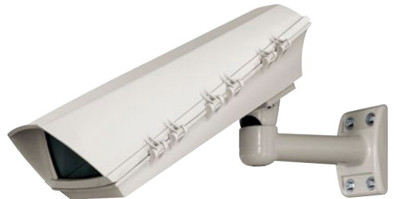
PUNTO + WBOVA2 BRACKET