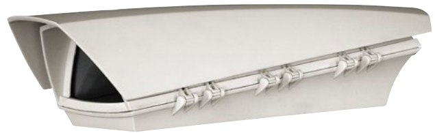
PUNTO + SUNSHIELD